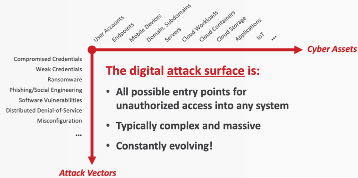
Figure: The digital attack surface of a modern organization

From more modern challenges like open-source vulnerabilities, misconfigured cloud services, and use of unsanctioned SaaS applications to traditional issues like unpatched operating systems and endpoint or network vulnerabilities susceptible to threats like ransomware, the digital attack surface is a primary source of cyber risk for an organization.